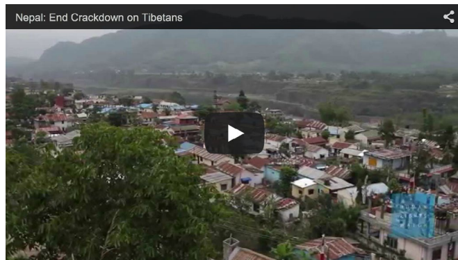
Nepal: End Crackdown on Tibetans 2014, Kathmandu, NEPAL