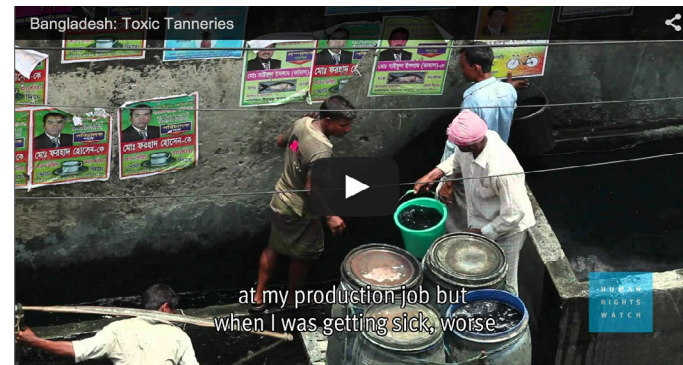
Bangladesh Toxic Tanneries 2012, Dhaka, BANGLADESH